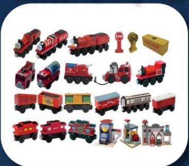
Thomas & Friends Wooden Railway Toys