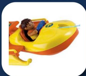
Go Diego Go Animal Rescue Boats