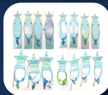
Beary Cute, Expressions, Sassy & Chic Children's Metal Jewelry