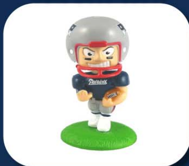
Football Bobble Head Cake Decorations