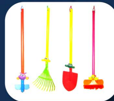
Children's Toy Gardening Tools