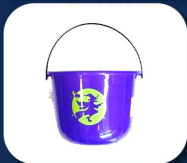
Purple Halloween Pails with Witch Decorations