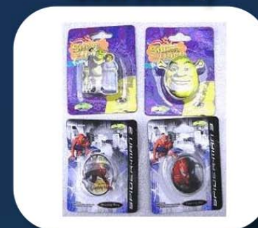
WeGlow Children's Metal Jewelry